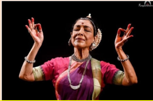
Odissi classical dancer Vidushi Madhavi Mudgal

Mayabunder, Diglipur, Hutbay, Amphitheatre Anarkali, Marina and Corbyn's Cove. Different Departments of the Administration will also take part in the ITF and depict the developmental activities taking place in A&N Islands through their stalls.